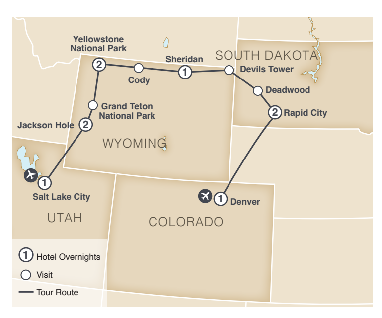
DAY 1 Arrive in Colorado: Begin your Western frontier adventure as you gather in Denver, Colorado. Meet your Tour Manager in the lobby at 6:00 p.m. for a welcome dinner. Meal: D